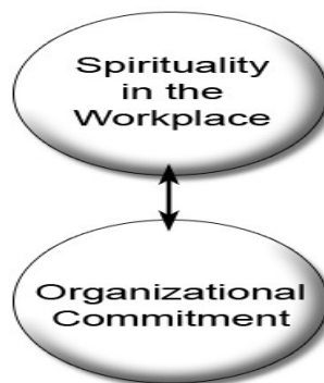
Figure 1: Model of the relationship between Spirituality in the Workplace, Organizational Commitment

Organizational commitment is an important variable that has been established as relating to individuals and organizational performance. The independent variable in this study is organizational commitment and the dependent variable is spirituality in the workplace.